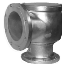
Table A - Size (Body & Flange)