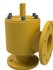
Table A - Size (Inlet x Outlet)