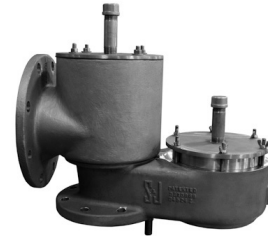
Table A - Size (Body & Flange)