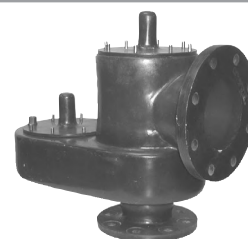
Table A - Size (Inlet x Outlet)